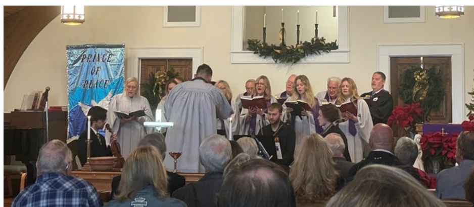
Cantata with UGA students in the choir and the string quartet