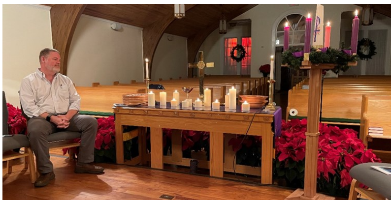
Blue Christmas Service