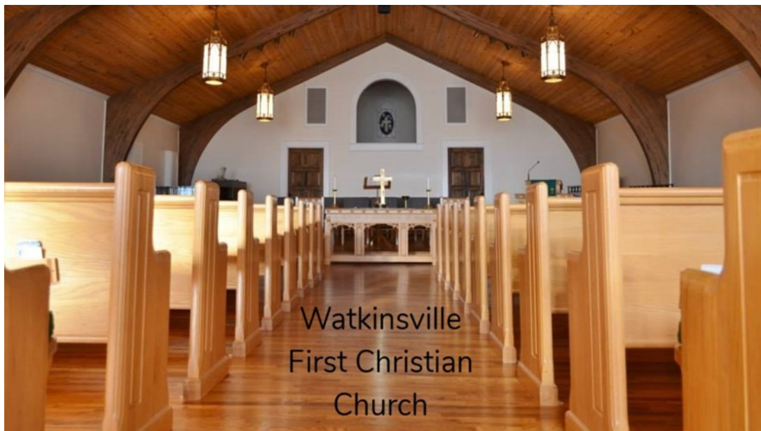
Watkinsville First Christian Church