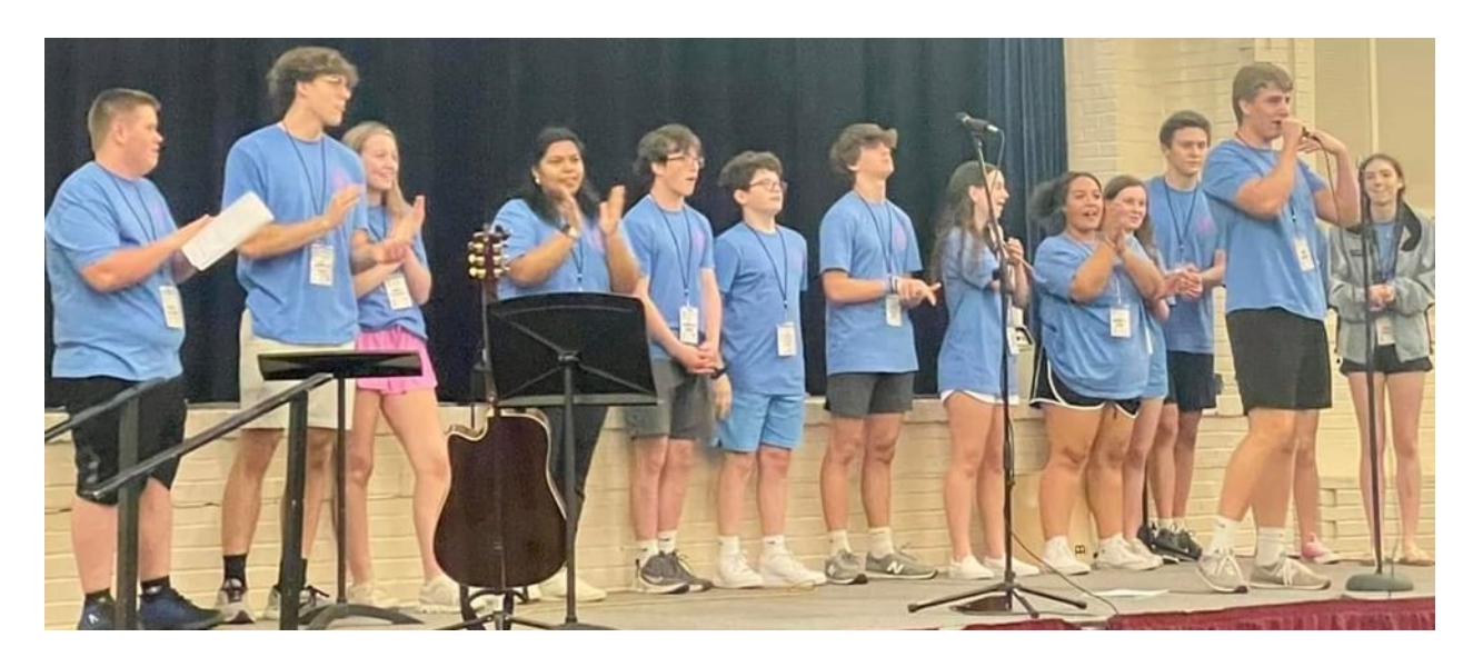
Youth Activities Council (YAC) teen volunteers in leadership at the Regional Youth Assembly