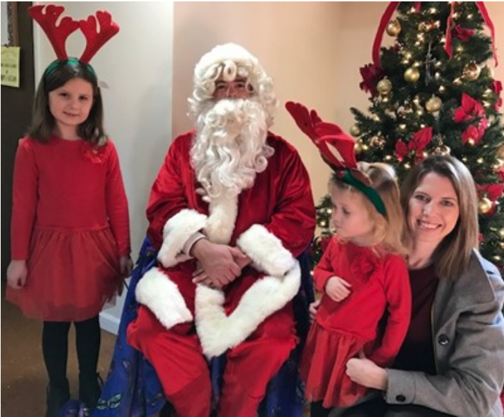
Santa greeted the children, young and old.