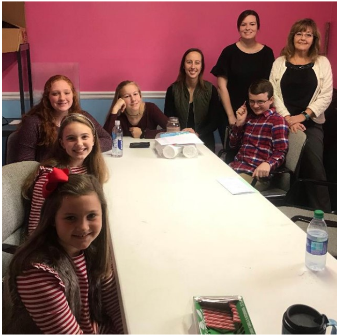
This is our elementary, middle, and high children gathering during Sunday School to plan Jesus' Birthday Party.