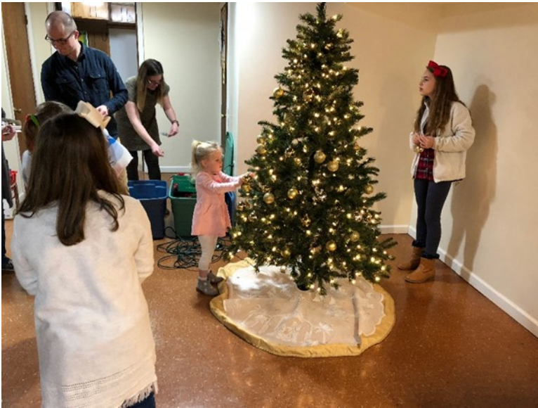
The group decorated the Christmas tree, tables, and even the windows.

The December Parents' Night Out event (hosted by the FCC Watkinsville Young Adult group) was a lot of fun for both children and the adults. A meal was shared, the fellowship hall was decorated for Christmas, the Ping-Pong table was enjoyed, and much more.