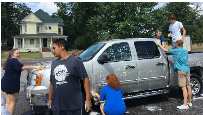
Youth car wash

The kids and youth have had great fun this past month.