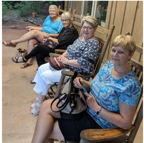
A few of the dinner group relaxing on the porch at Cabin Creek Bar-B-Que.