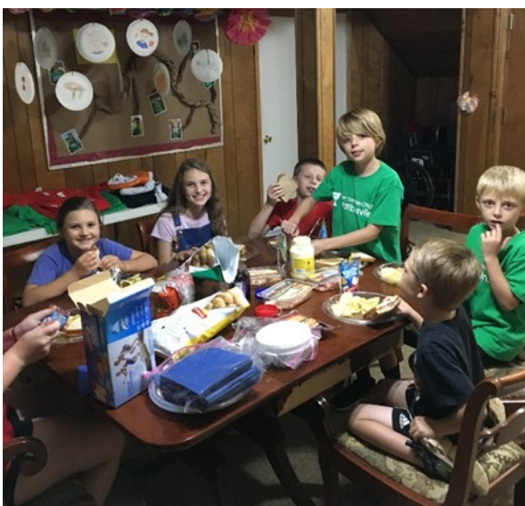
Friends Forever children's group