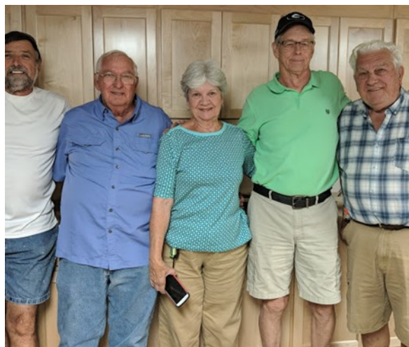
Our kitchen renovation volunteers. Donations are being accepted to pay for our new kitchen.