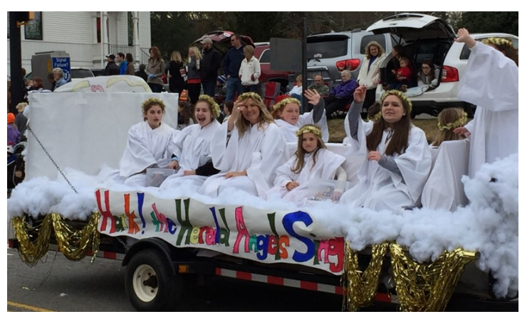
The Youth send a huge thank you to everyone who helped make the Christmas float possible.